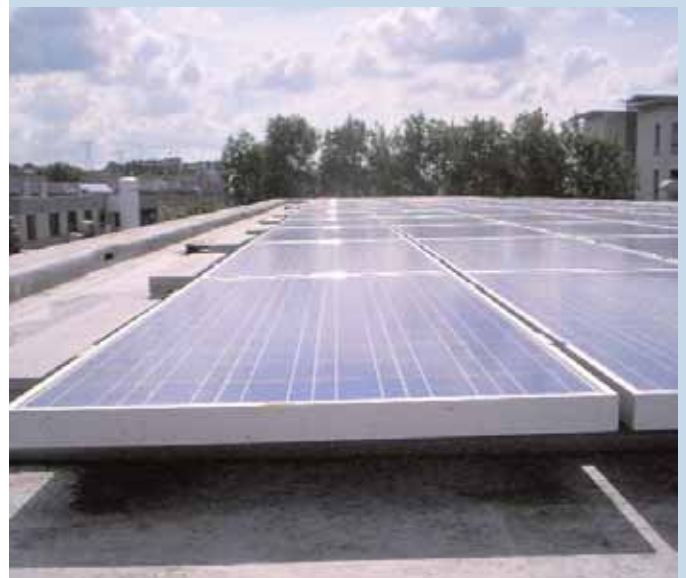
Fig. 3 - 42 kWp flat roof – top PV installation in Groningen, The Netherlands Oskomera.