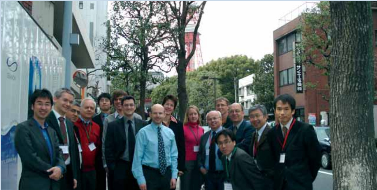
Fig. 1 - PVPS Task 2 Meeting in Tokyo, Japan, March 2007.